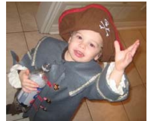
“yo ho ho and a bottle of rum!”

Thanks to all those (too numerous to mention) involved in preparations and running of the event.