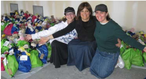
Our 3 Superwomen with 1,000 bears