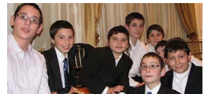
Our boys did us proud!

Some people have said that there was a tremendous feeling of achdus (Jewish unity) throughout the weekend. But there is a better word – mishpacha – family! There is a closeness that only a family can have.